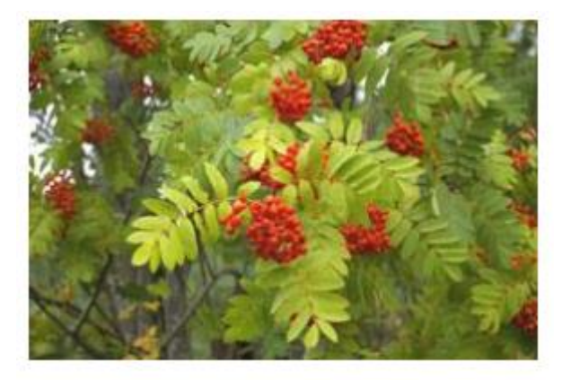
Rowan (Sorbus aucuparia)