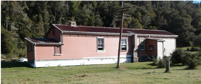
The Glenhope railway building from the eastern side (non-platform side)

Funding has been made available to fence around the immediate site of the building and to undertake some other improvements to protect the site.