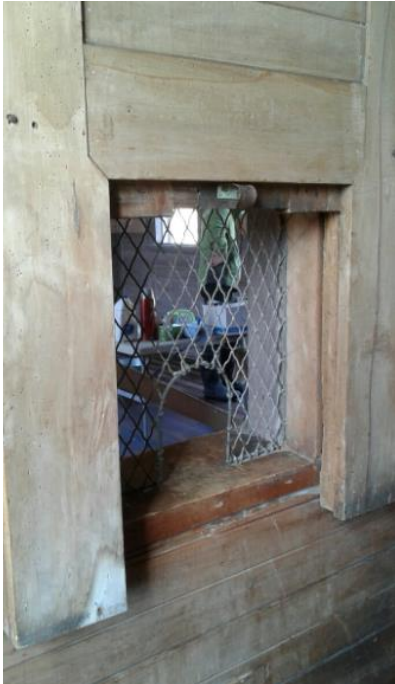
Detail of the ticket sales window