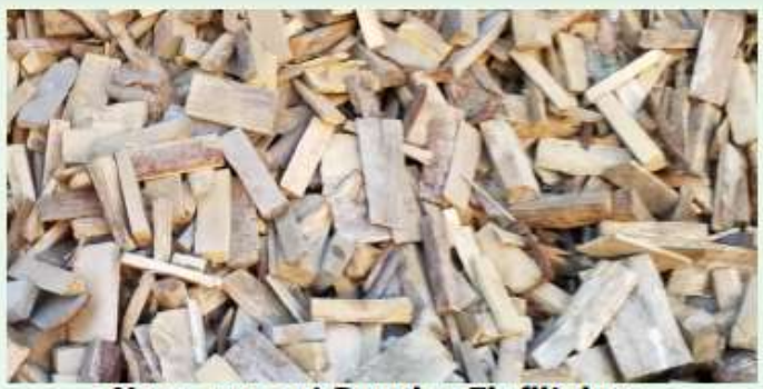
New: pre-cut Douglas Fir flitches. From kindling to regular firewood size.

Dry & Green Firewood - Beech, Bluegum, Douglas Fir, Pine DIY Wood - Logs & Rings of Beech & Pine, Bundles of Douglas Fir, Flitches