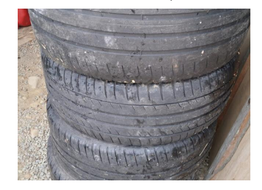
no longer required as sold Hyundai i30 – $150 for all 4 wheels

Michelin wheels 225/45 tubeless radial (4 wheels) 1 wheel is Pilot Sport 3