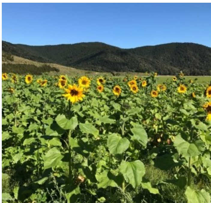
Ingrid McConochie has shared a picture of the sunflowers sown on the edge of a brassica crop at Lake Station

Just to let those who would like to come up for a cuppa at the café at Tophouse we will be closed until September for Bathroom renovations . Miles and Helen