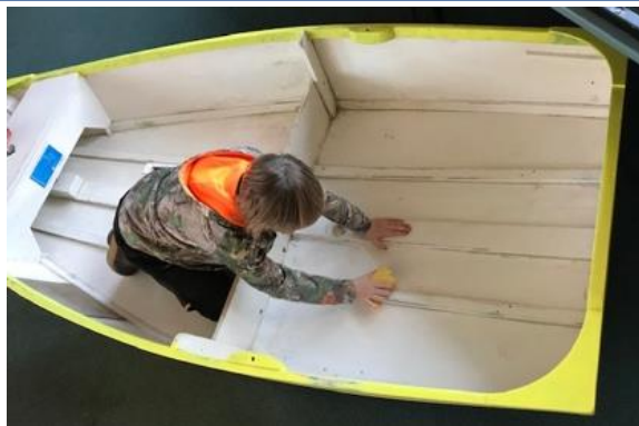
Hard at work sanding an Optimist