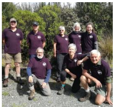
Friends ready to go trapping – in warmer months.

Meet – 10:00 am, Wednesday 19 August, DOC meeting Room, behind the Visitor centre (you can park in the VC carpark)