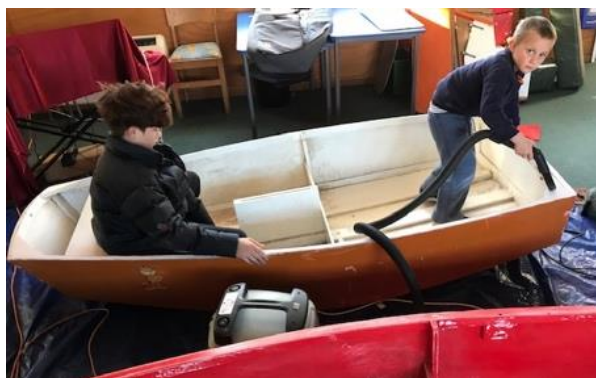
Everyone helping out