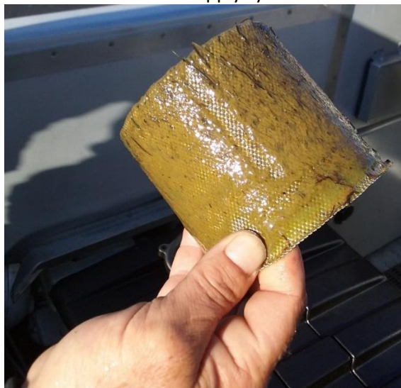
Lake snow on a filter...

Under certain conditions, Lindavia produces 'lake snow' – a sticky, mucus-like substance that hangs under the water surface. It is not toxic to humans or livestock and poses no risk to food sourced from the lakes, but can be a nuisance because it sticks to fishing gear, boats, motors, swimmers and water supply systems.