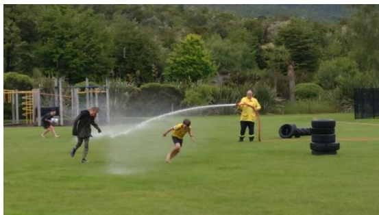
The Juniors had their own water battle around the pool.

One of the advantages of being a small school means that we can have a prizegiving where all parents can attend and keep to the 50 people COVID threshold. Maybe next year we will be able to have older siblings, grandparents, uncles and aunts able to attend. Let's hope.