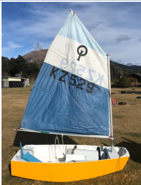
KZ529 is complete $200