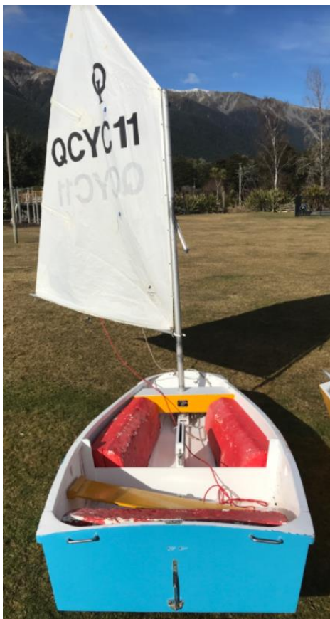
QCYC11 requires a rudder and the floats strapped in $150.00

Also sailing will hopefully start this Thursday from 6pm with set up day down at the lake where will put the new fibreglass boats together and maybe test them out on the water, of course weather permitting.