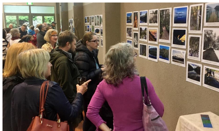
Viewing the adult display