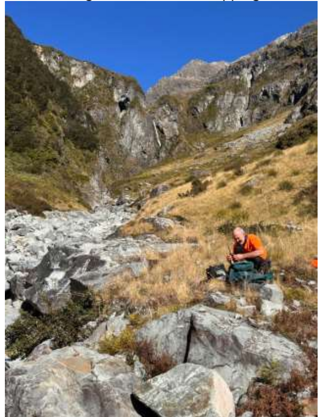
Graham Wallace in the Upper West Sabine.

Village trapping also took place last week, with teams heading out to the local trapping lines.