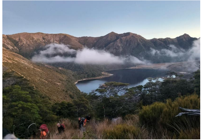
Boulder Lake, their previous home