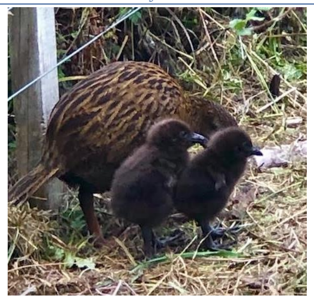
A pair of very young Weka chicks learning how to forage in our gardens along with a pair of adult birds.