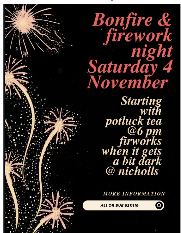
Fireworks night: Phone Ali or Sue 5211 110