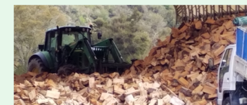
Larch firewood ready split

Come along to the new Kohatu Sunday Market starting on the 25th of September! This market will run every Sunday between the hours of 10am and 2pm. If you're interested in having your own stall please email Deb or Temika at kohatusundaymarket@outlook.com