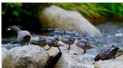
Te whakarauora whio: Friends of Rotoiti

Bring your boat, family and friends and help the Friends of Rotoiti and DOC staff set out 5 kilometres of stoat trap boxes from Coldwater Hut to the swing bridge. No experience required to carry the trap boxes to sites along the existing track at the southern end of Lake Rotoiti.