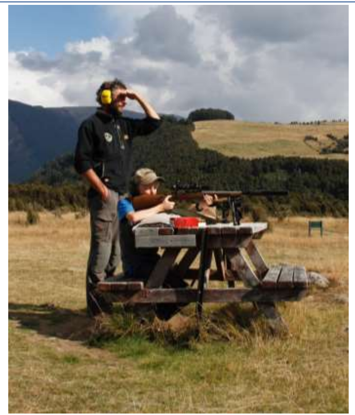
All shooting should be under the eye of a person acting as a range officer to safeguard against the intrusion of walkers. All unlicensed shooters must be under direct supervision. Maximum permissible distance is 100 metres (at the benchrest).

Safe firearm usage is a legitimate recreational activity and is supported by DOC Nelson Lakes and the Nelson branch of New Zealand Deerstalkers' Association. To find out more, visit www.doc.govt.nz