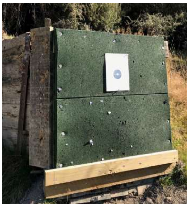
Figure 2: Paper targets only and must be fixed to the bullet catcher.