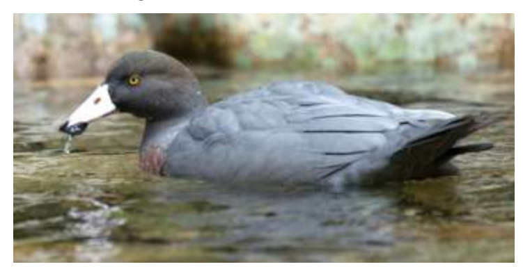
Whio/blue duck

They are threatened by the usual predators, changes in water use and quality and sometimes by recreational users disturbing nests.