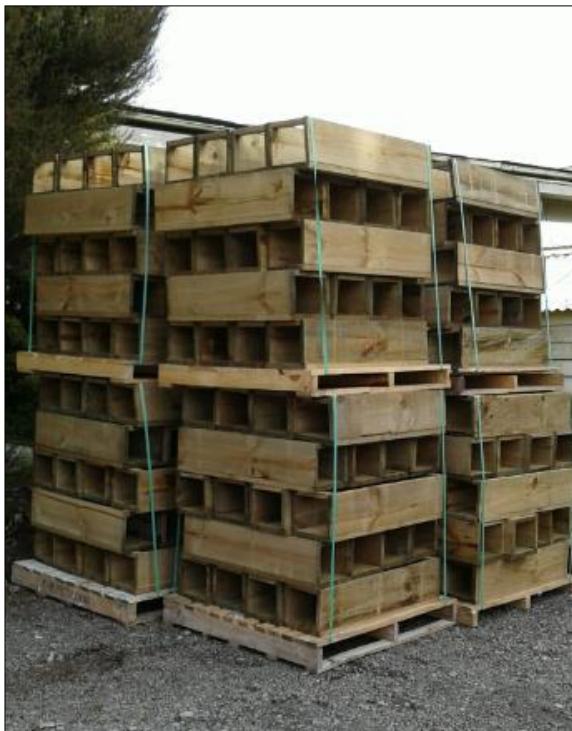
Just one of the stacks of new double set trap boxes waiting for attention.