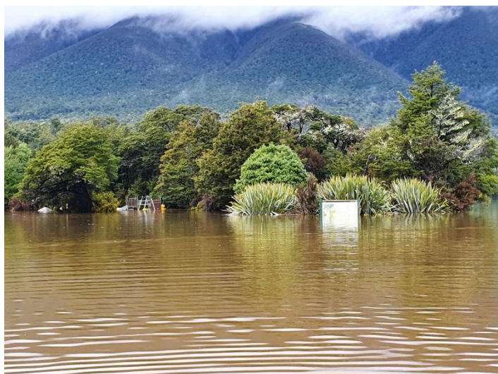
Kerr Bay in flood 18 July