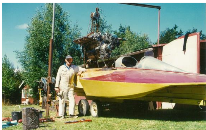
the late Dick Shuttleworth, lowering the Rolls Royce motor into the hull

This boat is a "must see" at the museum.