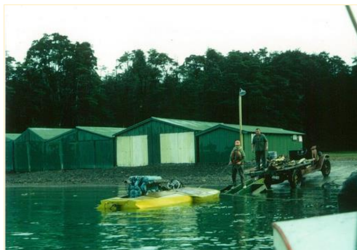
Flak Too being launched at the old western ramp-Kerr Bay