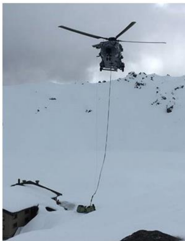
Two bags of firewood placed gently in the deep snow at Angelus Hut