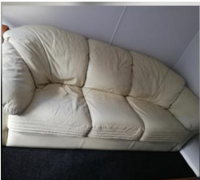
Couch for sale

All information will be confidential to the emergency group"