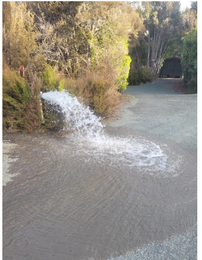
A torrent not a trickle! This could save your life and/or your house