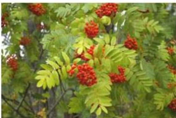
Rowan ( Sorbus aucuparia )