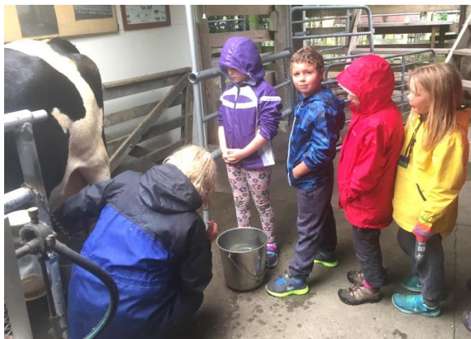
Preparing to have a go milking a cow.....