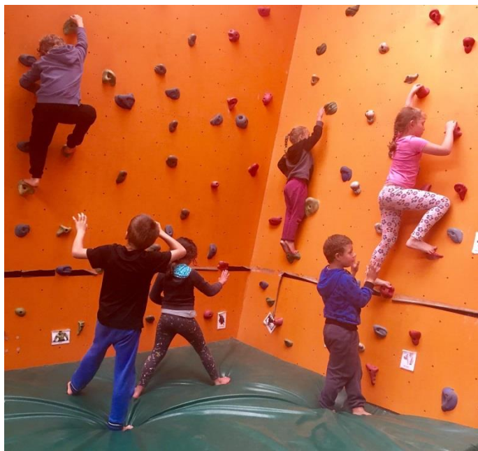
Juniors on the Boulder Wall at Living Springs