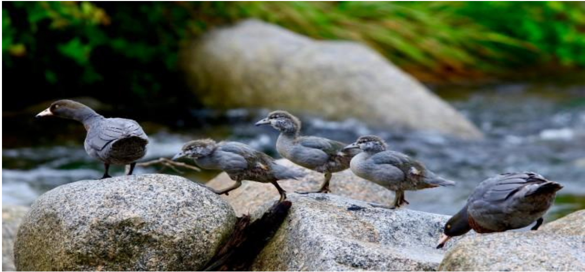
Whio family on the Heaphy

At 52km long, this trap line is one of the longest in the country and we are very grateful for the local support we have received from the community, DOC and iwi along with the Rata Foundation who provided Friends of Rotoiti with the funding to see this project through.