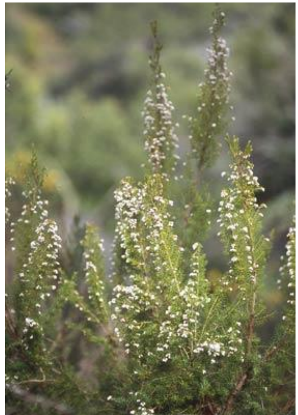
Spanish heath in flower

Contact Gareth on 03 521 1806 or grapley@doc.govt.nz