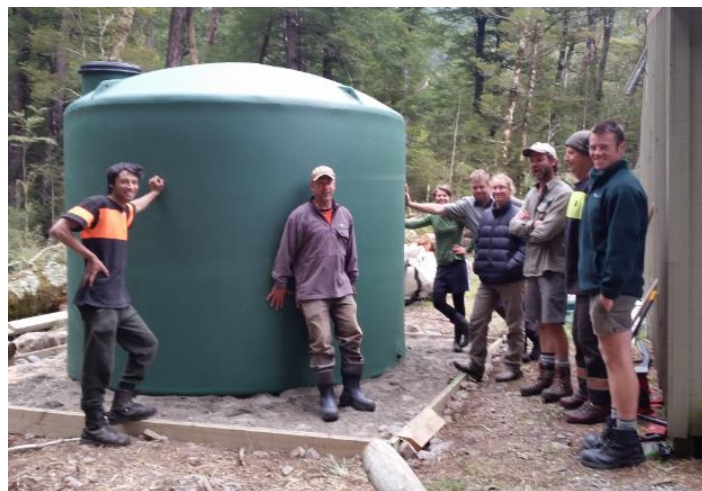
The team inspect the new water tank at West Sabine.

Earlier in the week, the Hukere bridge on the Cascade track – between Travers Valley and Angelus hut – was re-installed for the summer.