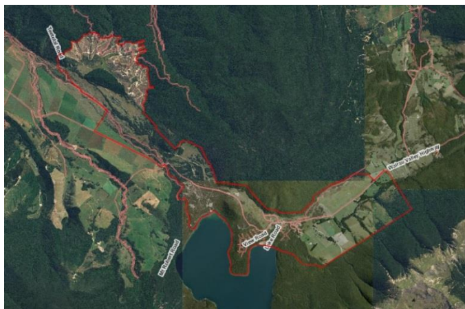
Map - Proposed Site-led pest plant control zone

The difference under the new site-led plan is that landowners can also be required to remove or allow removal of these target weeds. This is necessary to ensure that control programmes have a reasonable chance of success over the term of the plan, and so that the efforts made by the greater proportion of residents are not undone through the lack of action by a small minority of residents.