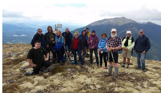
The Nelson 4Wheel Drive Club at the Beebys trig.

Thank you all for your hard work and great company.